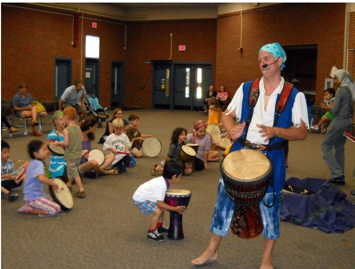
"Playtivity" at Miller Library Summer Reading Finale

Summer 2010 was a busy one for kids at the libraries. 1,398 children attended a total of 61 programs at the 3 library locations. In addition, 461 children signed up to participate in the Summer Reading Game "Make a Splash @ Your Library"