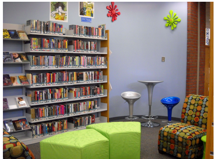
Expanded teen area has a bright, new look.